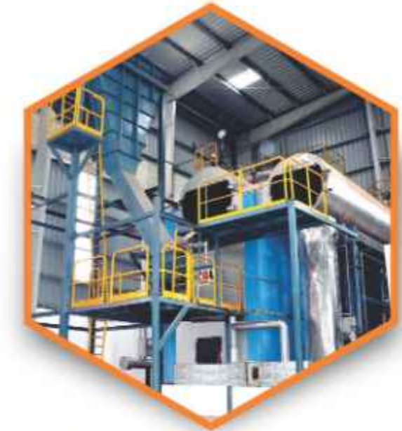
Intas Pharmaceuticals Ltd (Dehradun) 5TPH, 10.54 kg/cm 2