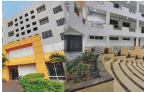
Hotels, Hospitals and Institutions